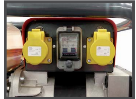
DURABLE SCREW-IN SOCKETS & METAL COVERED FUSE BOX