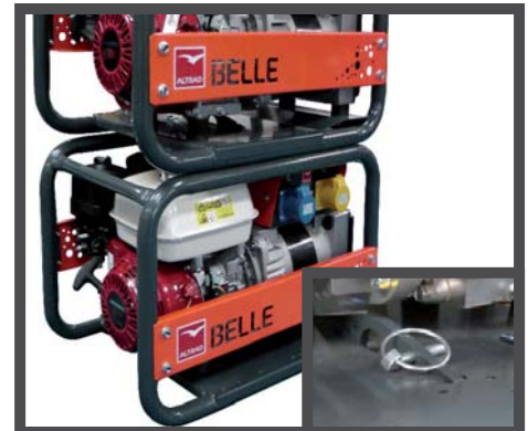
STACKABLE ENGINE PROTECTION FRAME WITH SECURING CLIP