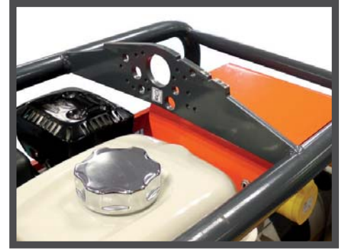
SINGLE POINT LIFTING